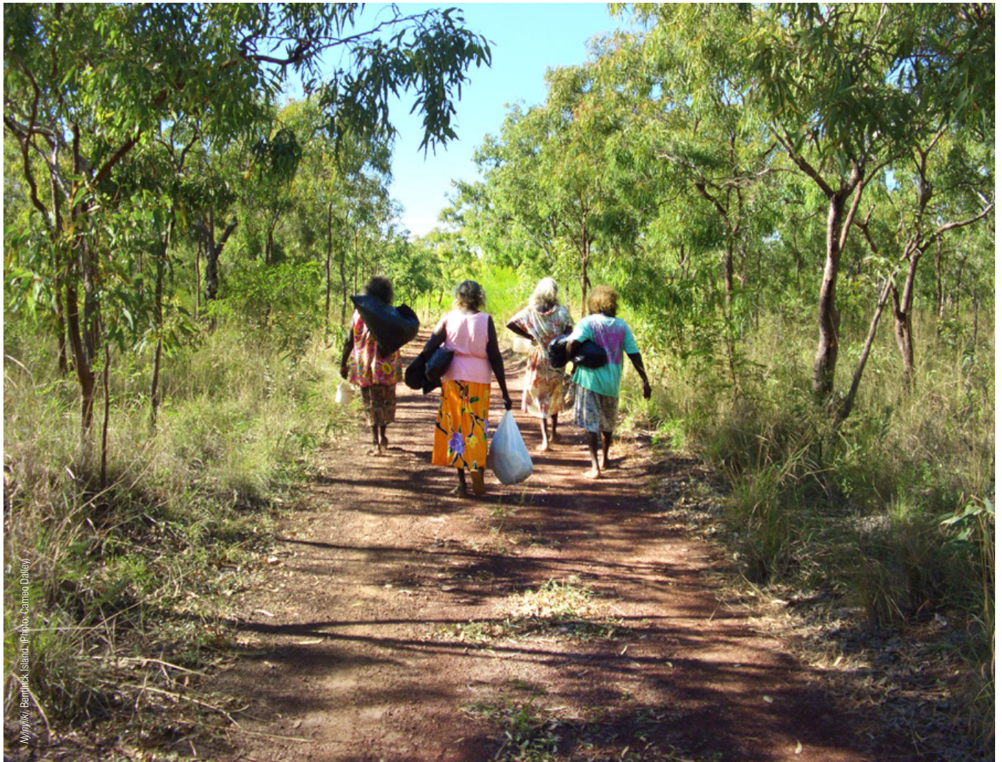
Wiyiniki Bandlrick Island